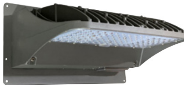
PWP1LTP Shown Mounted.

Aluminum Two-Piece Trim Plate, Bronze Powdercoat Finish, 16 1/2"W x 8 3/8"H